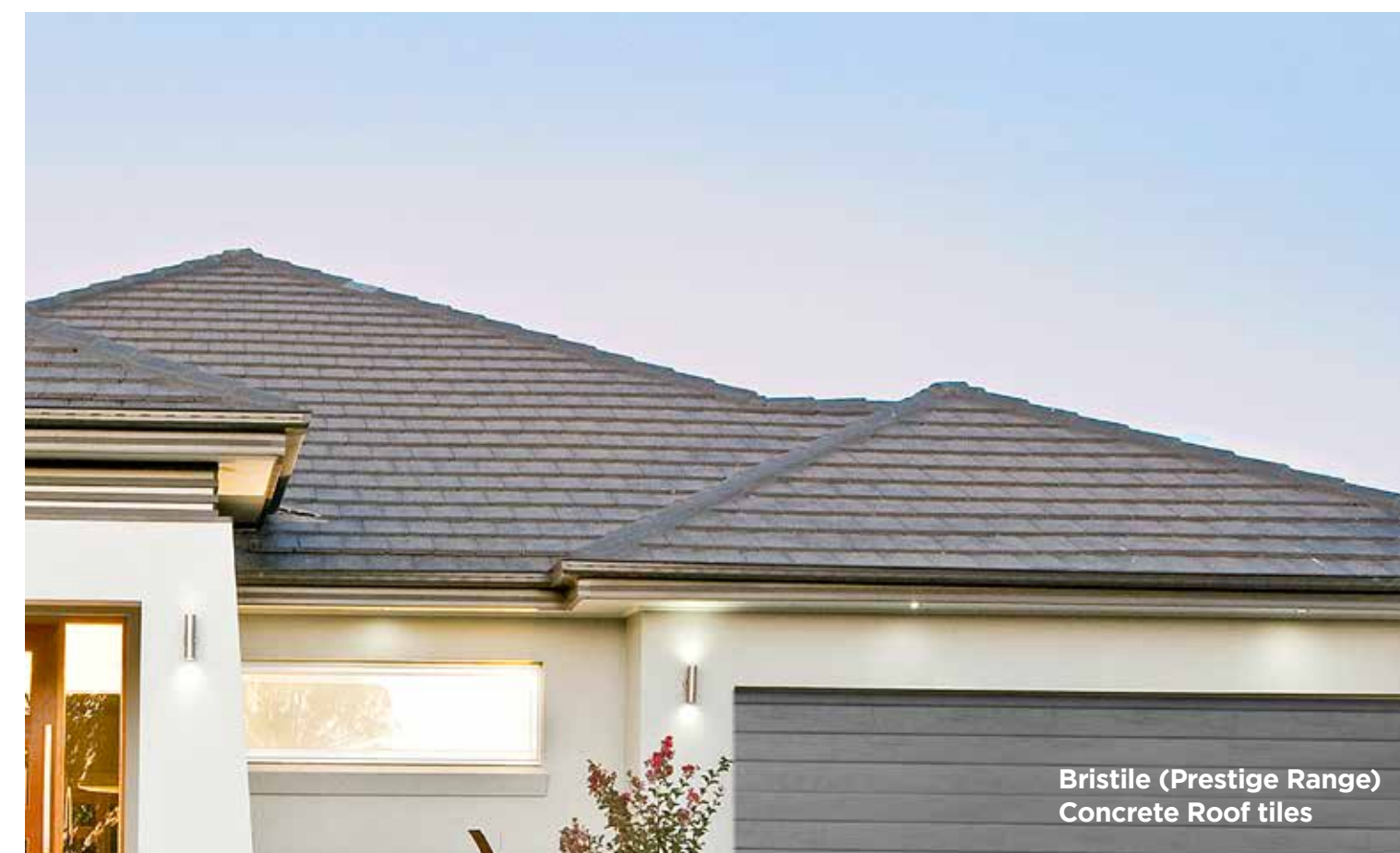
Bristile (Prestige Range) Concrete Roof tiles