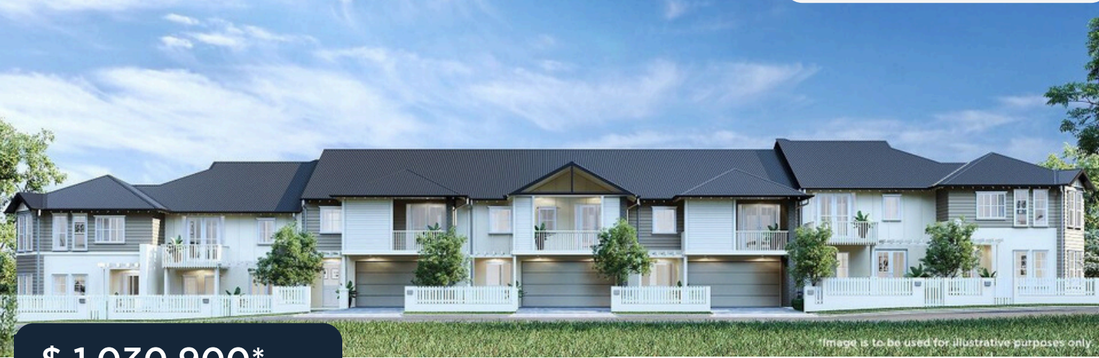
*Image is to be used for illustrative purposes only

$ 1,030,900* UNDER CONSTRUCTION FIXED PRICE* PACKAGE