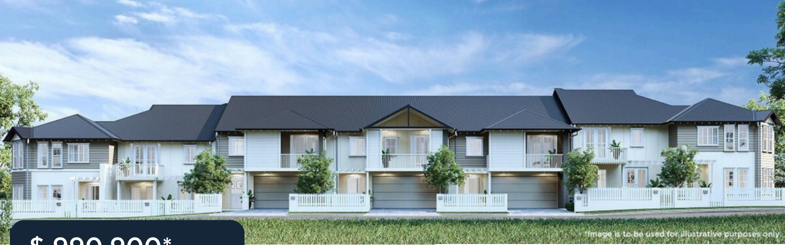
Image is to be used for illustrative purposes only