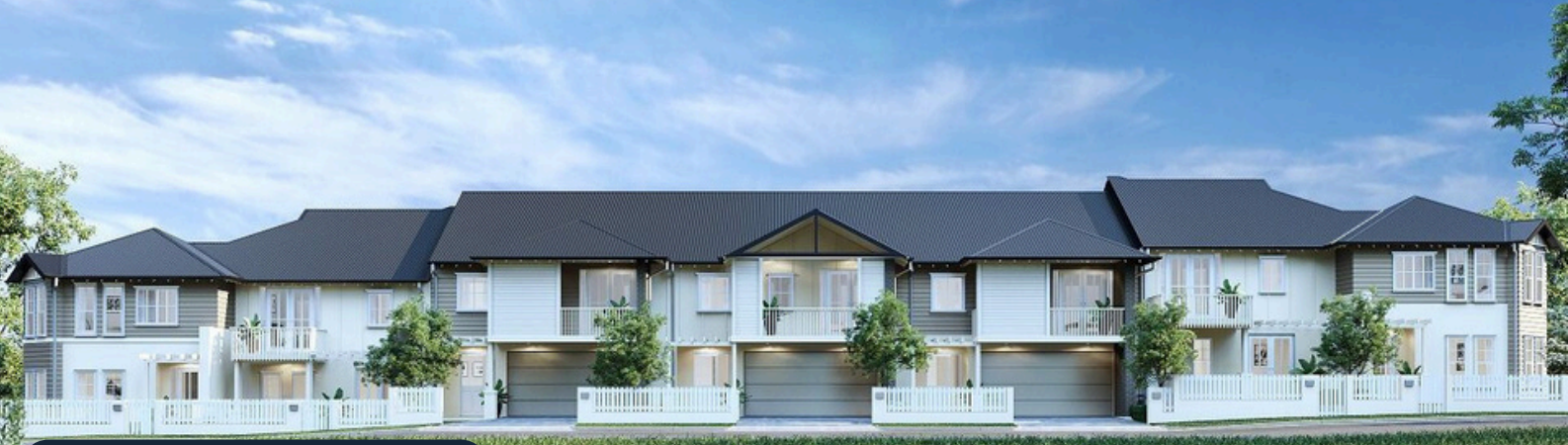
Image is to be used for illustrative purposes only

$ 970,900* UNDER CONSTRUCTION FIXED PRICE* PACKAGE