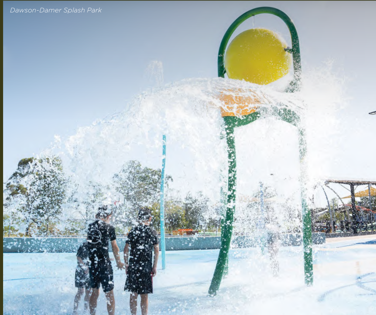
Dawson-Damer Splash Park

Banksia puts you at the centre of all that's inspiring and convenient in Oran Park. A verdant expanse of trees and walking paths lead from your front door to the award-winning Splash Park. You're also a brisk walk away from the exciting new Oran Park Hotel – a state-of-the-art dining and entertainment hub near the vibrant Town Centre. Inviting you to enjoy the best of both worlds, Banksia connects you to a welcoming community that ticks all the boxes.