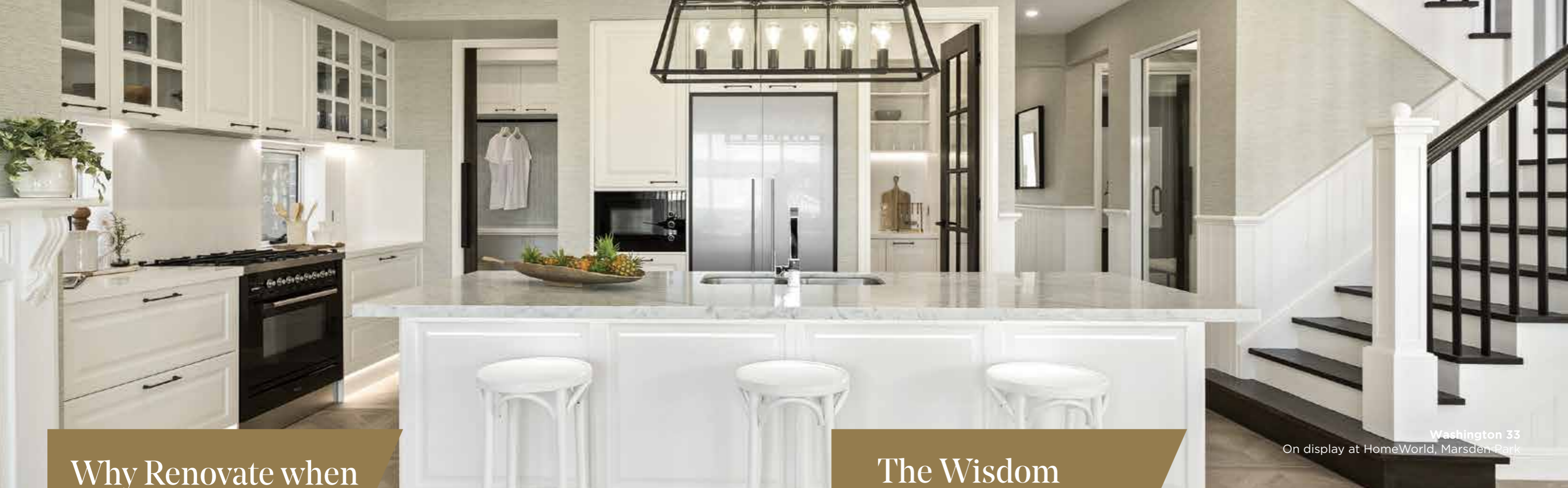
Washington 33 On display at HomeWorld, Marsden Park