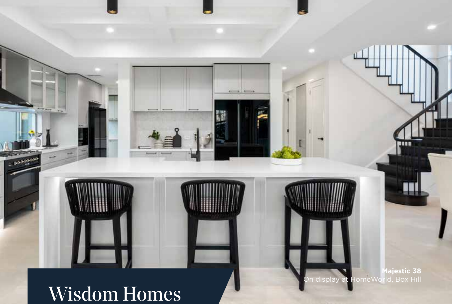
Majestic 38 On display at HomeWorld, Box Hill