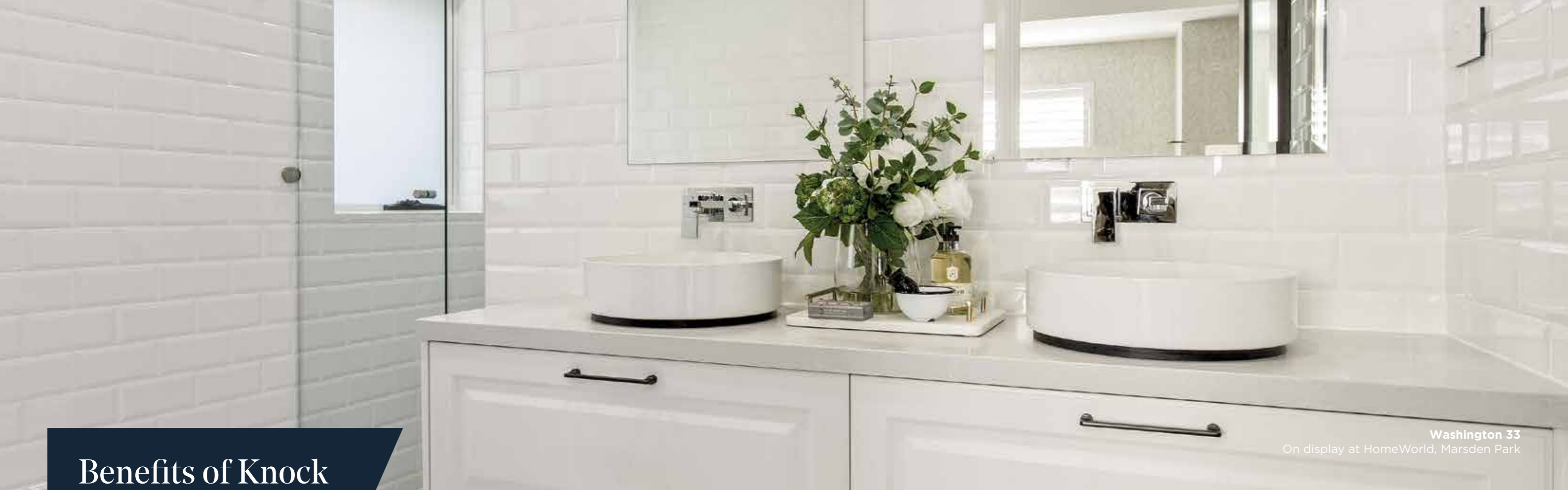
Washington 33 On display at HomeWorld, Marsden Park