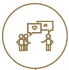
Aspiration 36 On display at HomeWorld, Box Hill

Our approach has always been to look after our customers every step of the way, that's why we've made our Knock Down Rebuild experience fully transparent and straightforward.